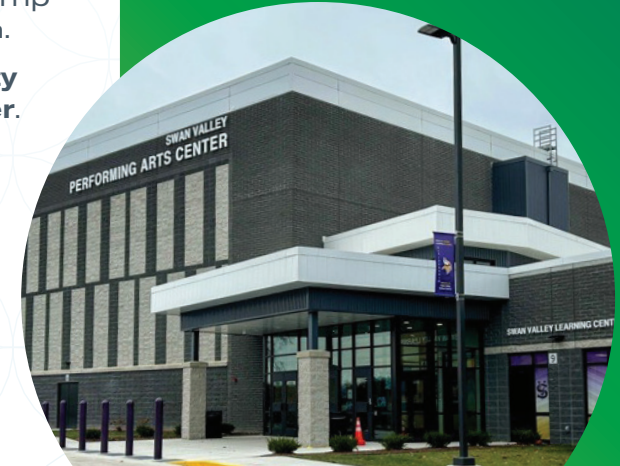
SWAN VALLEY PERFORMING ARTS CENTER