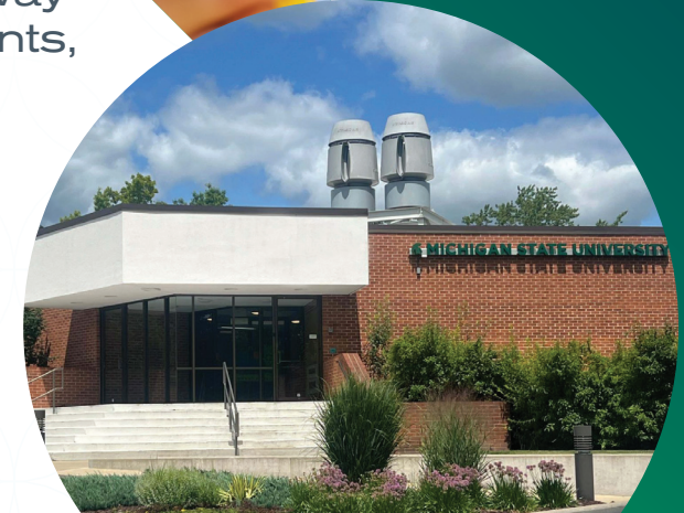
MICHIGAN STATE UNIVERSITY ST. ANDREWS